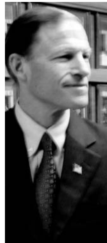
Atty. General Blumenthal