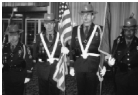
State Police Color Guard Tradition Continues