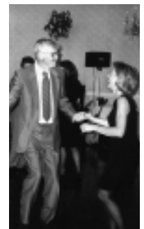
Dancers Popular Feature