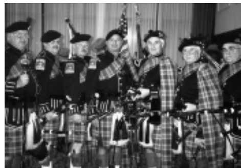
State Police Pipes and Drums Popular Group