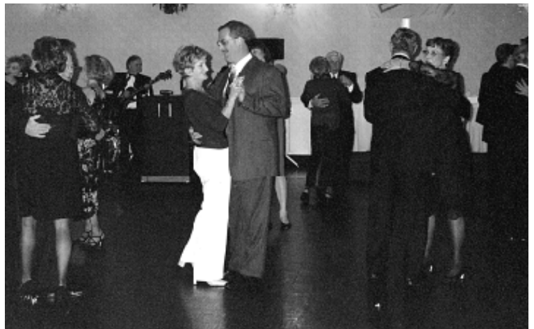
After Dinner Dancers