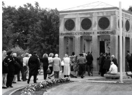
After the indoor ceremony, families, colleagues, and officials paid respects at the Police Memorial.