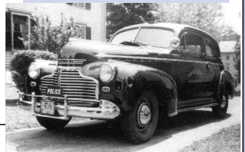
Southington's cruiser, 1941