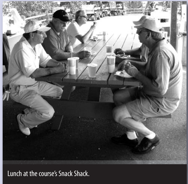
Lunch at the course's Snack Shack.