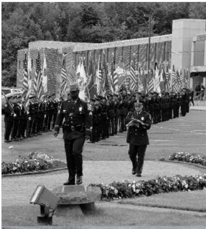
An honor guard connected the Academy with the Police Memorial.

indoors this year. The auditorium was well-filled with state and local officers, Academy trainees, dignitaries, and adult relatives