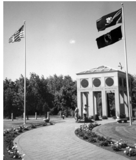
Law Enforcers Memorial

A social hour at Table Green, a short distance from the club house, will begin immediately after play is completed. The steak dinner will be served at approximately 4 p.m. ■