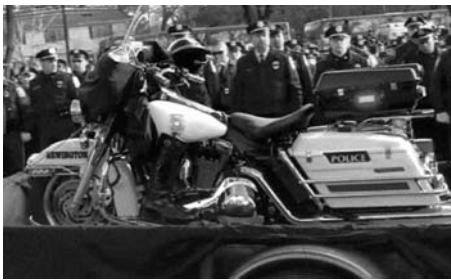
Officer Lavery's motorcycle in procession.