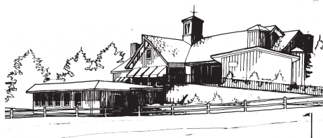
Tunxis Plantation Clubhouse

A social hour at the Table Green will begin immediately after play is completed. The steak dinner will be served at approximately 4 p.m. ■