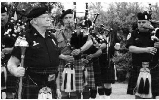
Waterbury Police Pipes & Drums