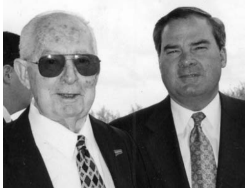
Gov. (Ret.) Bill O'Neill – Gov. John Rowland