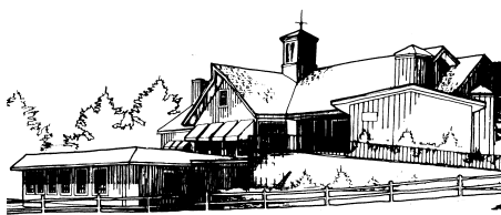
Clubhouse At Tunxis