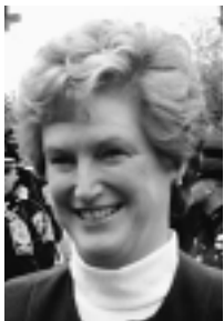
Lt. Gov. Rell

The memorial site will consist of a plaza-